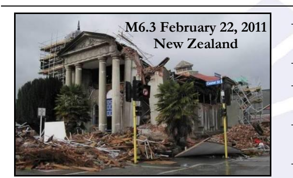
Collapsed unreinforced masonry structure in Christchurch