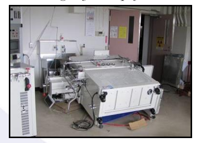
Equipment impacts: toppled unrestrained lab workstations