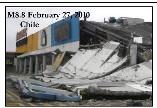
Collapsed concrete tilt-up wall panels due to weak wall-to-roof connections