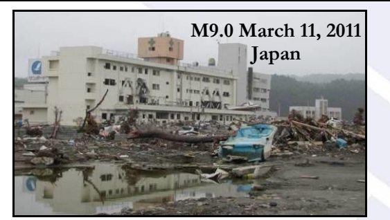
Seismically retrofitted hospital in Minamisanriku survived as a vertical (tsunami) evacuation shelter